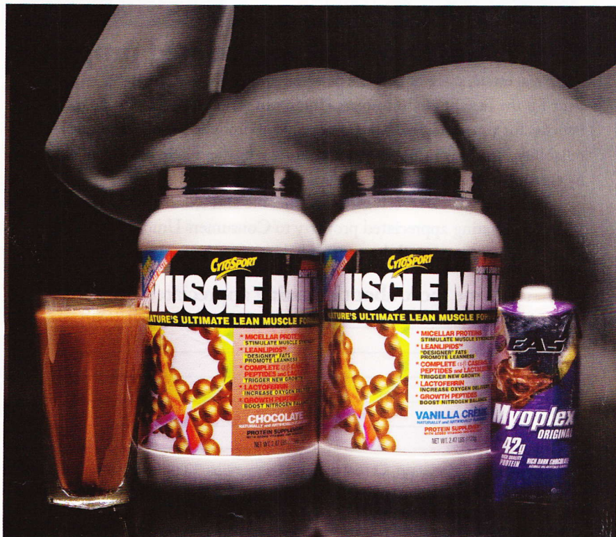
TEST RESULTS EAS Myoplex Original Rich Dark Chocolate and Muscle Milk Chocolate and Vanilla Crème can expose users to elevated levels of heavy metals when they consume three servings a day.

"Most consumers and even many doctors don't realize that in this country we're left to simply trust the manufacturer to decide what level of quality and safety they'll provide," says Pieter Cohen, an internist at Cambridge Health Alliance and author of a recent New England Journal of Medicine article on contaminants in dietary supplements. Even in California, some manufacturers don't comply with the requirements of Proposition 65 to put warnings on supplements, and enforcement seems to be lax. Sometimes warnings appear only after lawsuits are filed.